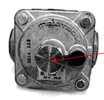
Convertible regulator with octagon cap. Unscrew from regulator.