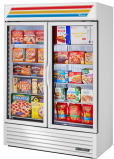
Standard White Exterior